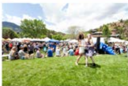
Manitou Springs Colorado Wine Festival Save the date! Saturday, June 2, 2018

Each year we gather over 800 of the Rockies' top Manitou Springs Colorado Wine Festival brings together 20 Colorado wineries, live music, food & gift vendors in beautiful Memorial Park in Manitou Springs. Be one of the first 1,000 to purchase a ticket and receive a free wine tote. Now this year, limited VIP tickets with high-end wines, shorter lines and local eats included. Get your tickets and then make a reservation at one of our charming visitors inns!